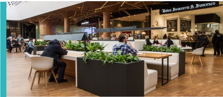
CITYLIFE SHOPPING DISTRICT, ITALY

With a modern and fashionable look this food hall in Milan is tailored to fulfil its visitors' needs: it has multiple kiosks, eco-stations, 6 lounge areas, silence pods, dining swings, a variety of different seating arrangements and even a stage to host multiple events.